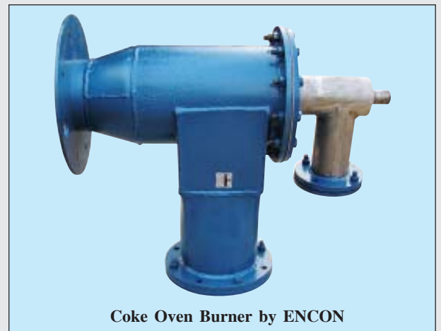
Coke Oven Burner by ENCON

REMEMBER - A DROP OF FUEL SAVED IS A RUPEE EARNED